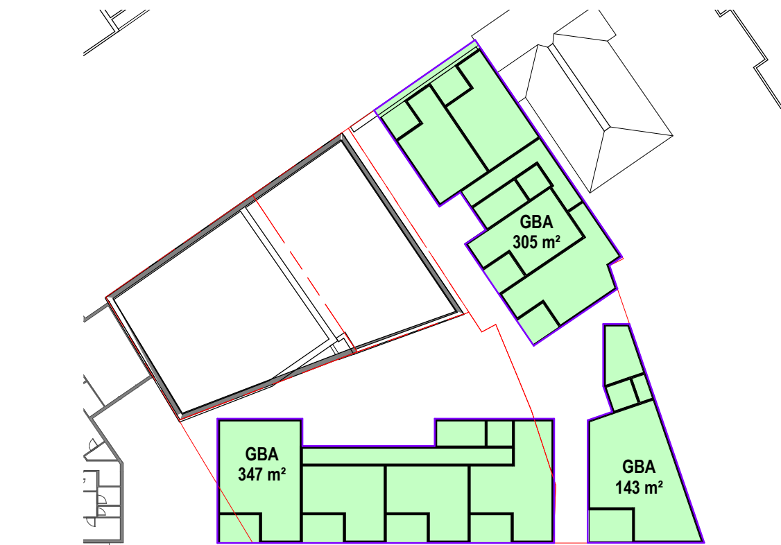
5 SB_LVL 02 SDE-1122 1 : 500