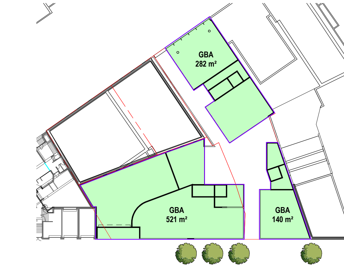
3 Upper Grnd Lvl FFL SDE-1122 1 : 500