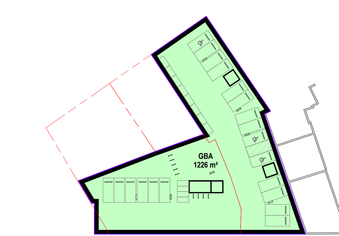
1 Level B2 FFL SDE-1122 1 : 500