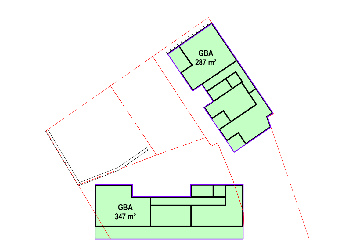
7 SB_LVL 04 SDE-1122 1 : 500