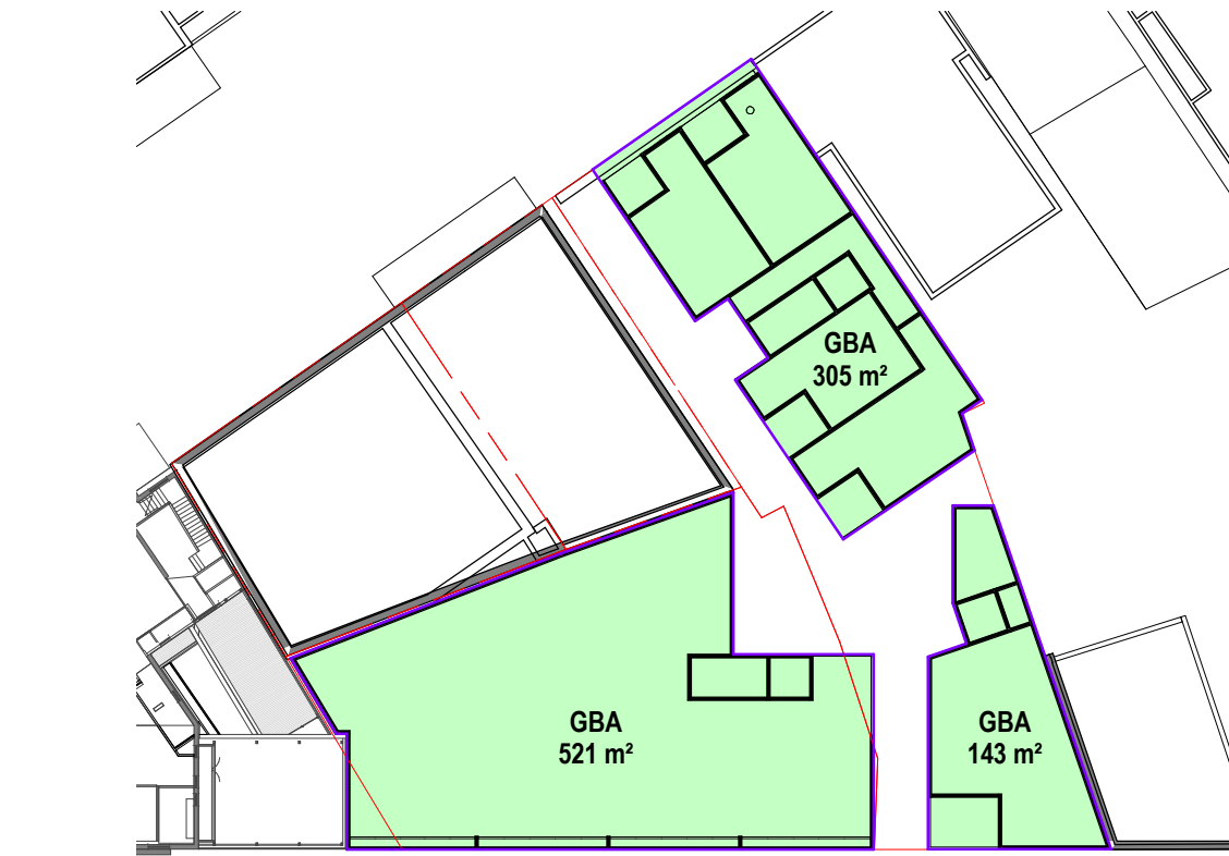
4 Level 01 FFL SDE-1122 1 : 500