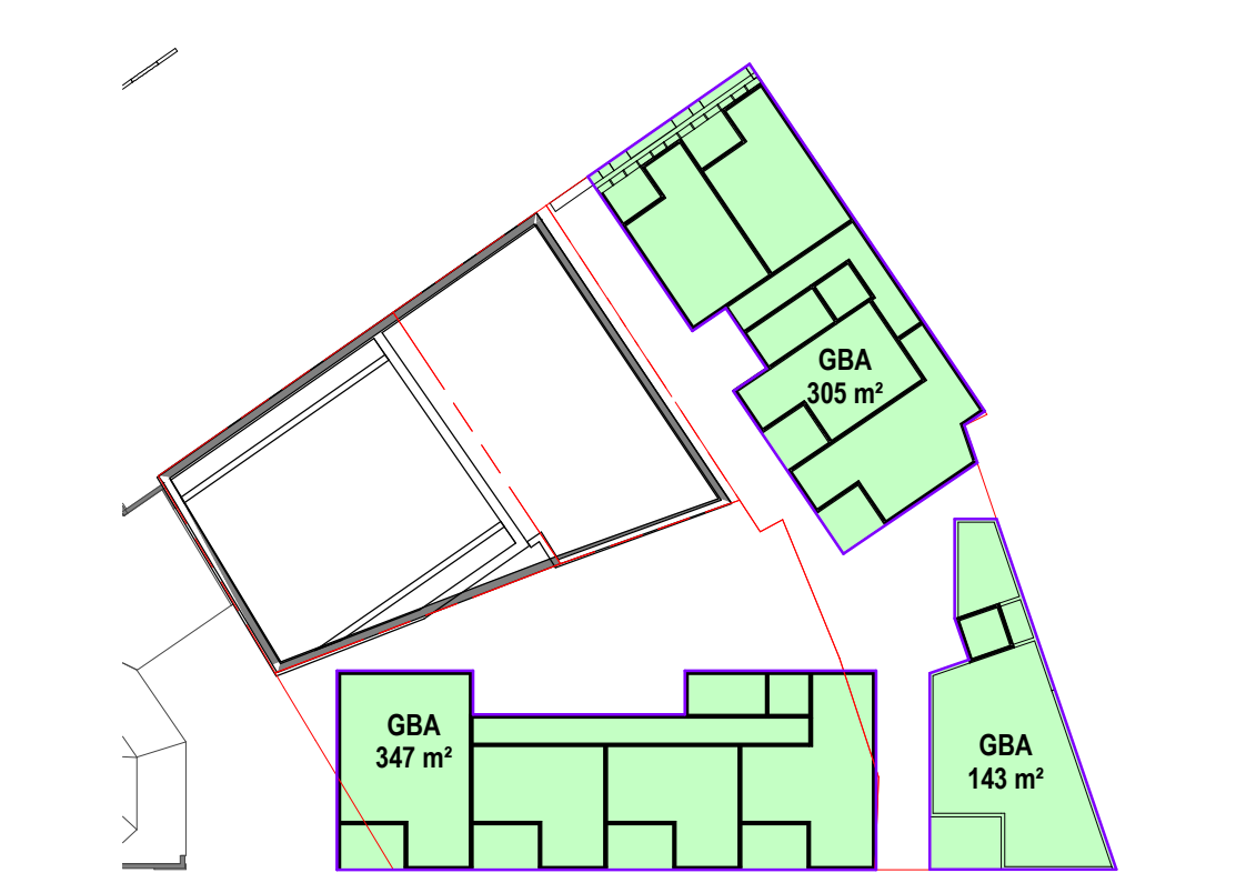
6 SB_LVL 03 SDE-1122 1 : 500